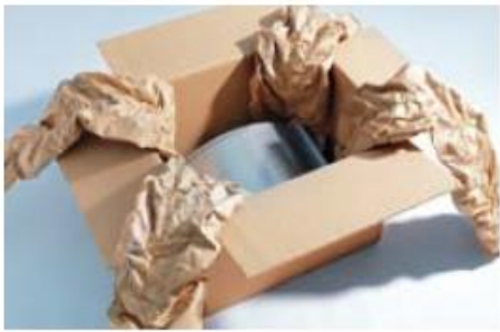
Cushioning method for fragile items.