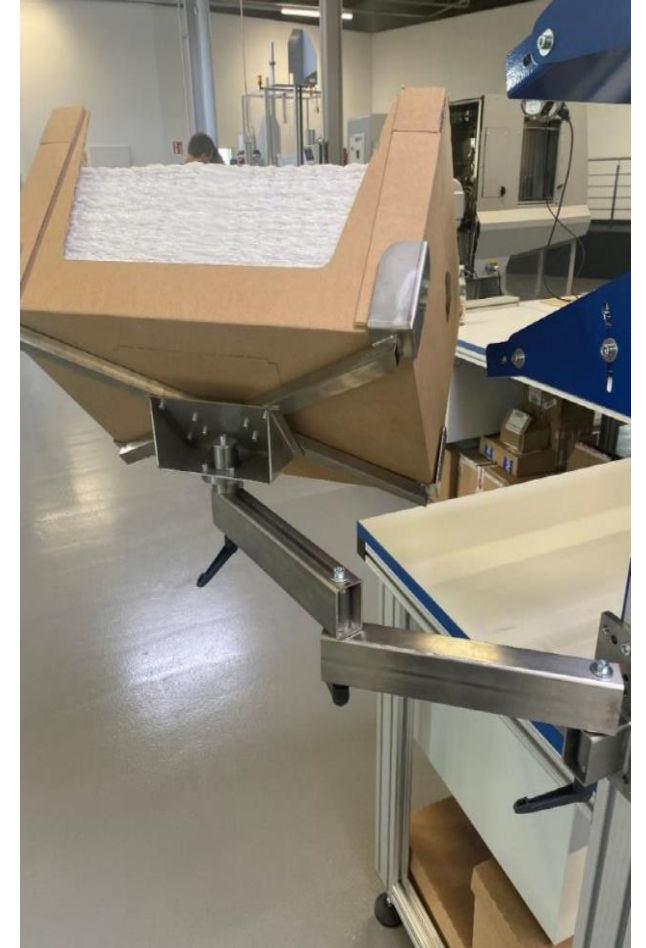
Articulated Arm- Table Stand