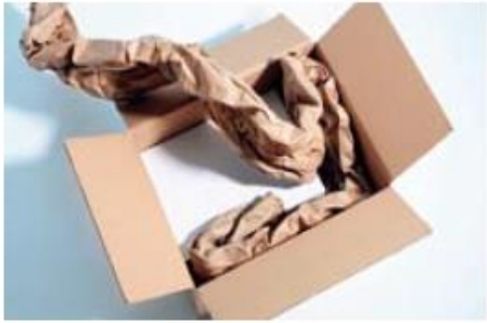
Block and brace objects to prevent migration.