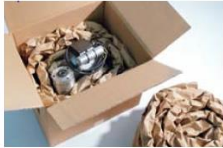
Coil or wrap to stabilize and protect objects.