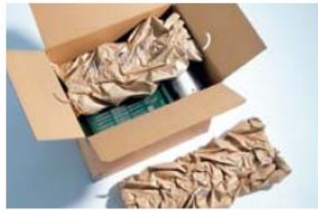
Convenient and easy for void-fill applications.