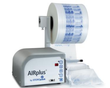
AIRplus® Cushion & Void